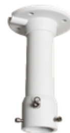
DF21Y Pendant Mount