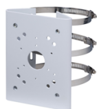
A36 Pole Mount