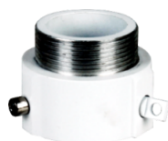
A37 Installation Adapter