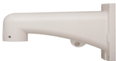
DF20Y Wall Mount