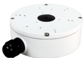
A22 JUNCTION BOX