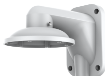
A25 Corner/Pole Mount