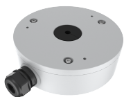
TC-P548BM Spec: V1 Junction Box