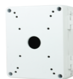
811 Junction Box